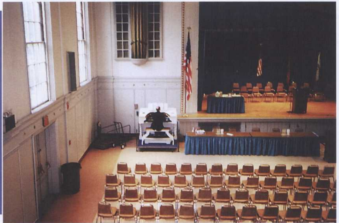
Town Hall Auditorium before a town meeting.

and swinging across into a door gains access to the solo chamber. The blower and relay room is below the stage. While the combinations for each manual are set in the rear of the console, the organ also has ten general combinations, whose setter board is in the relay room. The console is normally located on the floor to the left of the stage, below the main chamber. It can be rolled to the center for concerts.